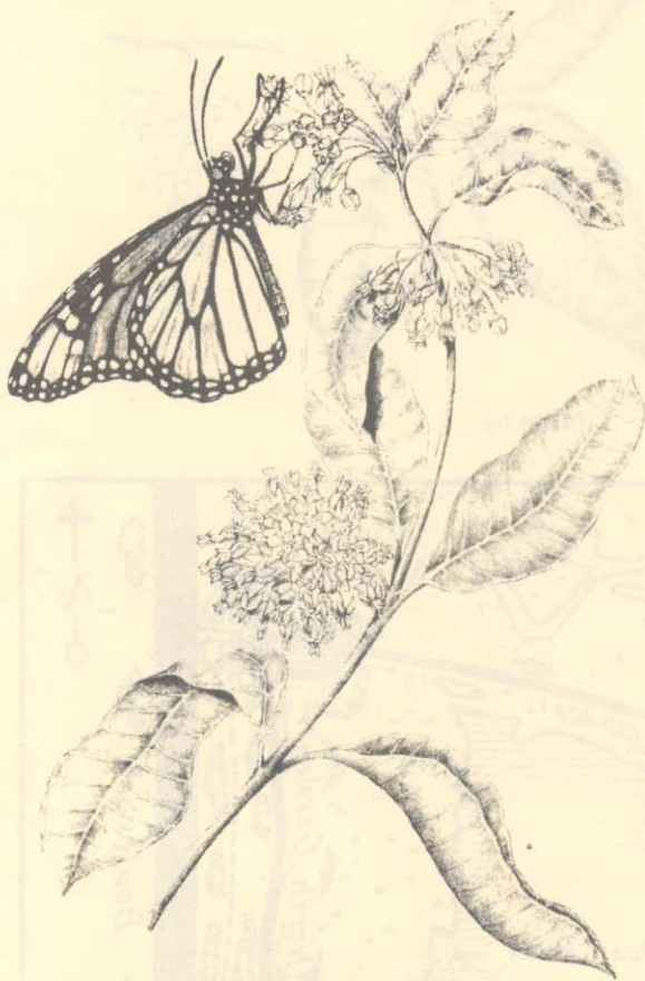
Monarch on Milkweed

terflyweed, Lance-leaved Coreopsis and Common Milkweed add fragrance and color as well as provide a nectaring source for these beneficial insects.